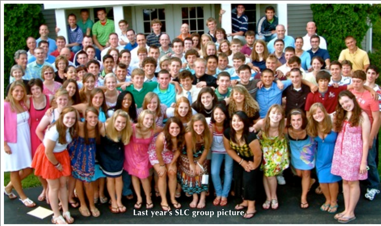
Last year's SLC group picture