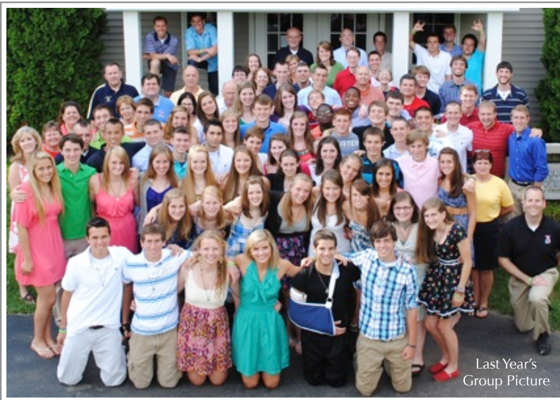
Last Year's Group Picture